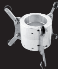
Customized tilt version